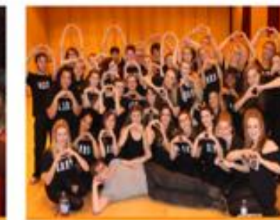
Media & Performance