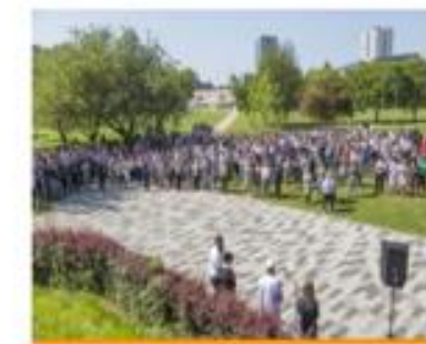
Charity and Liberation