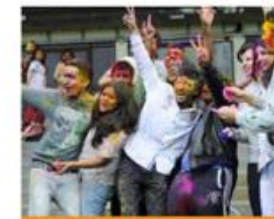
Start A Society