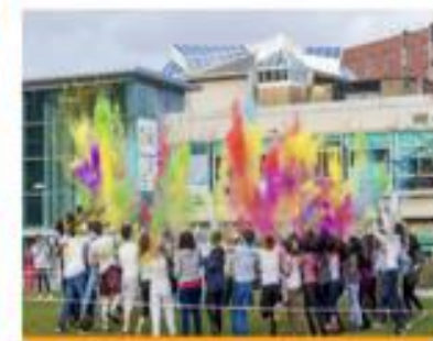
Find A Society