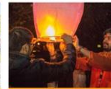
Faith and Culture