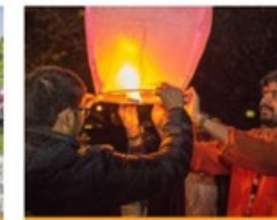
Faith and Culture