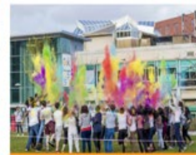
Find A Society