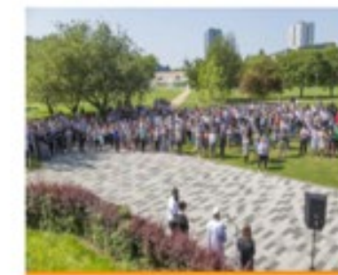
Charity and Liberation