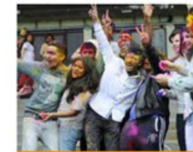
Start A Society