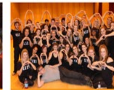
Media & Performance