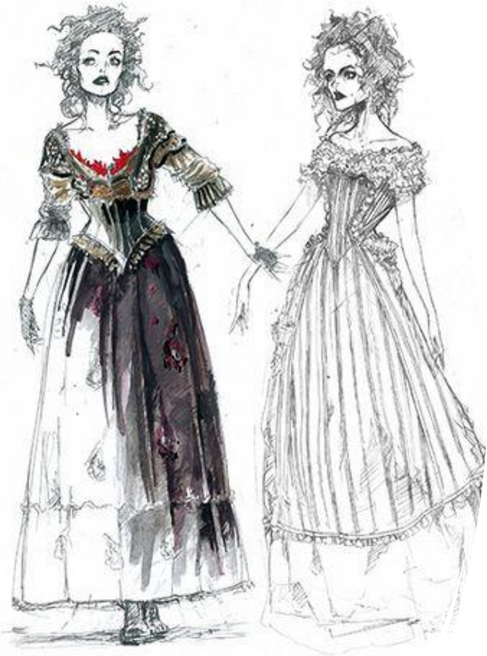
Mrs Lovett – Design by Colleen Atwood