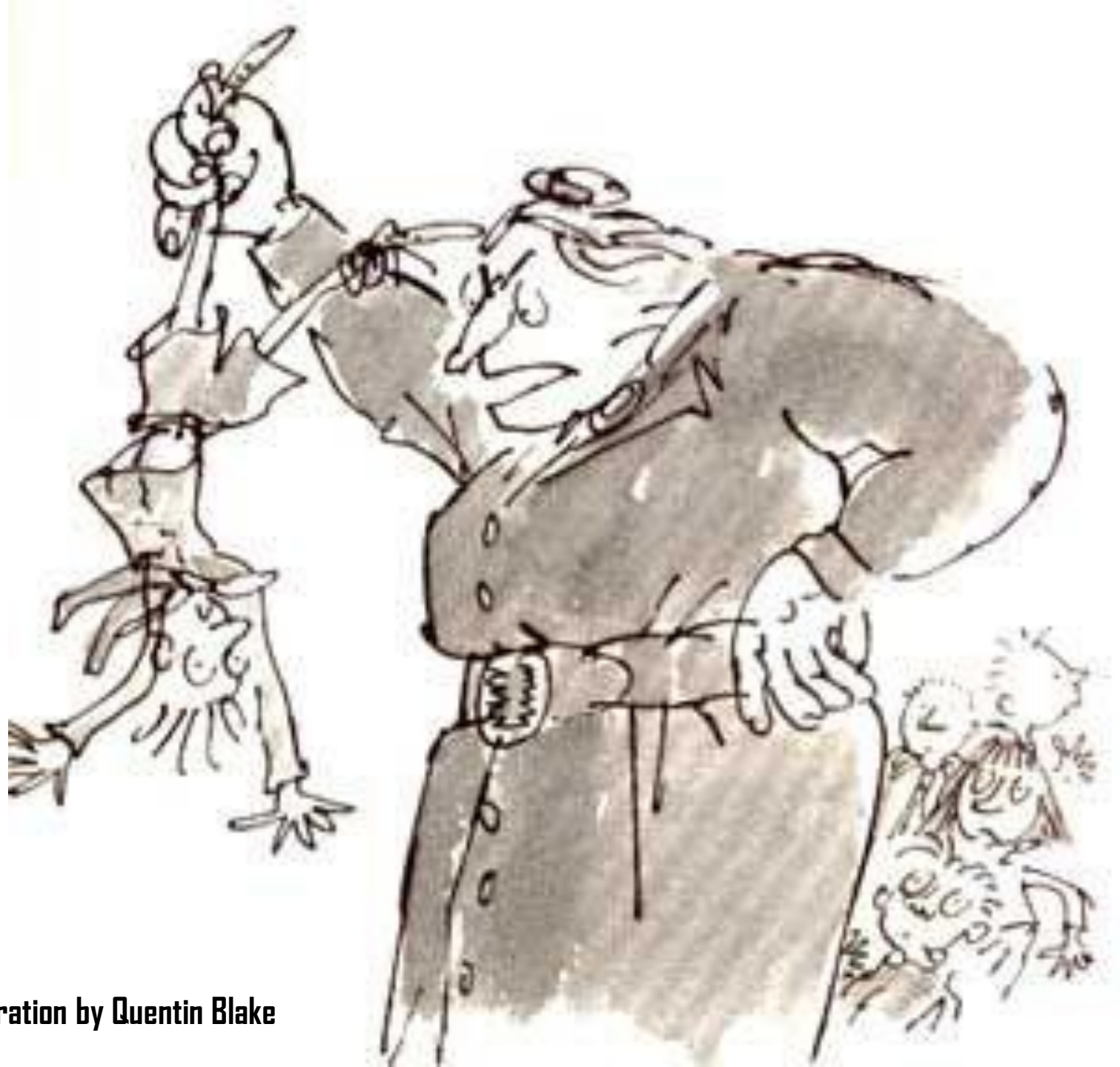
Illustration by Quentin Blake