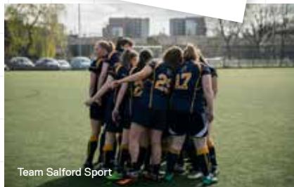
Team Salford Sport