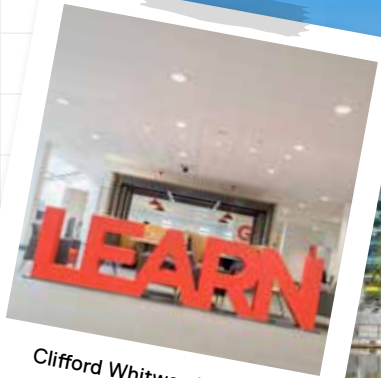
Clifford Whitworth Library