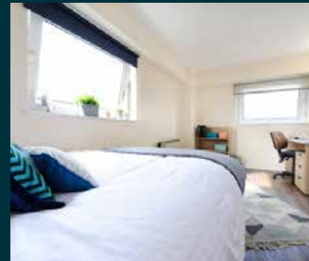
Diamond room in John Lester and Eddie Colman Courts

We know that one of the most important decisions students will make about life here at Salford is where they are going to live and this can be a big transition period for both the students and parents/carers. With the University being based close to such a vibrant city like Manchester, there are many accommodation options available. We want you to feel comfortable with the decision your child is making in this regard and we understand you may want to explore all the possibilities.