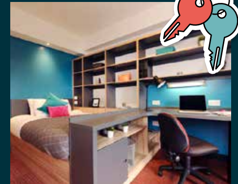
Gold room in Peel Park Quarter