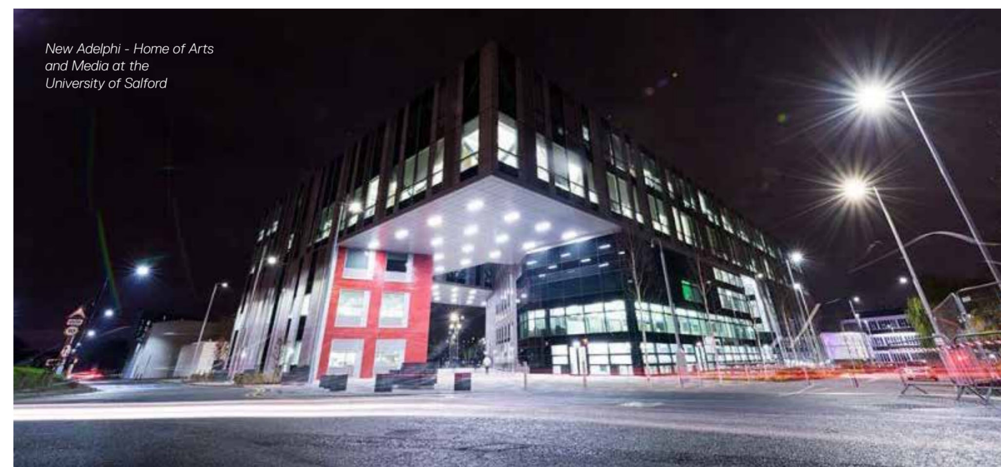
New Adelphi - Home of Arts and Media at the University of Salford

For more information and to book your place visit our booking page: www.eventbrite.co.uk/e/school-of-arts-and-media-teachers-and-advisors-conference-2018-tickets-44258873482