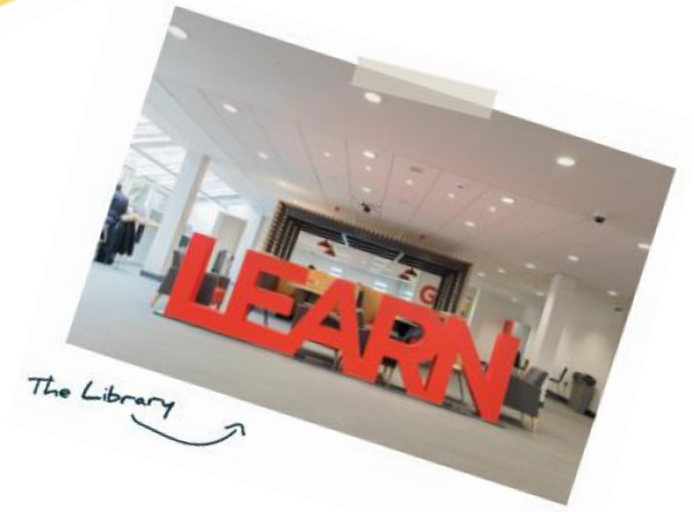
The Library →