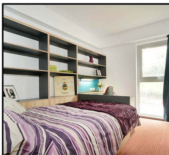
Peel Park bedroom