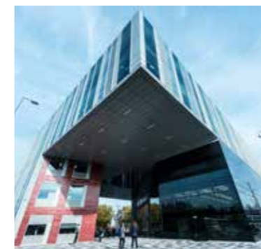
New Adelphi, Peel Park

We have two campuses across the city of Salford: Peel Park and MediaCityUK. Peel Park is the site of the former Royal Technical Institute of Salford, which was housed in the iconic Peel Building, and MediaCityUK is our state-of-the-art digital, creative and media campus.