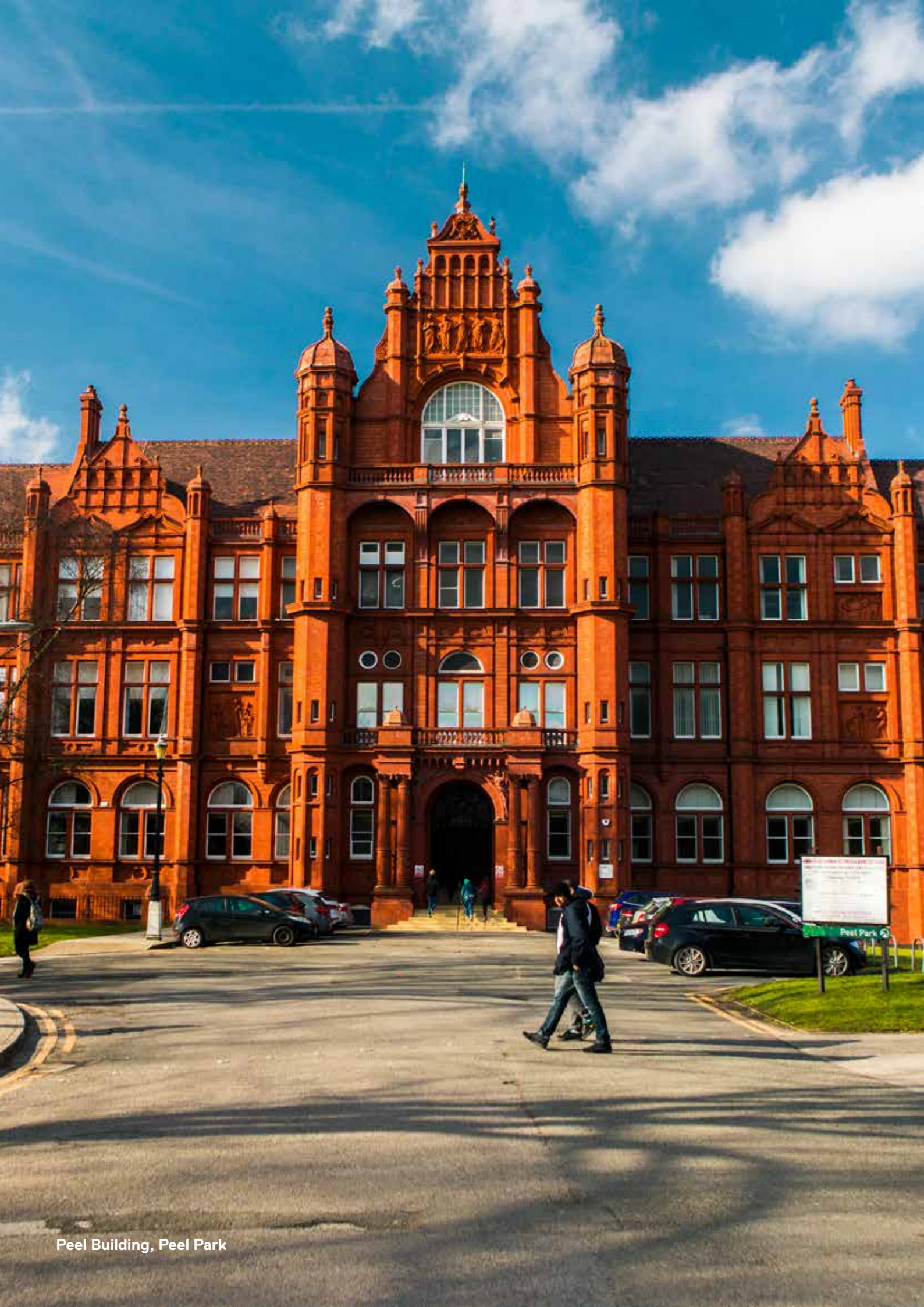
Peel Building, Peel Park